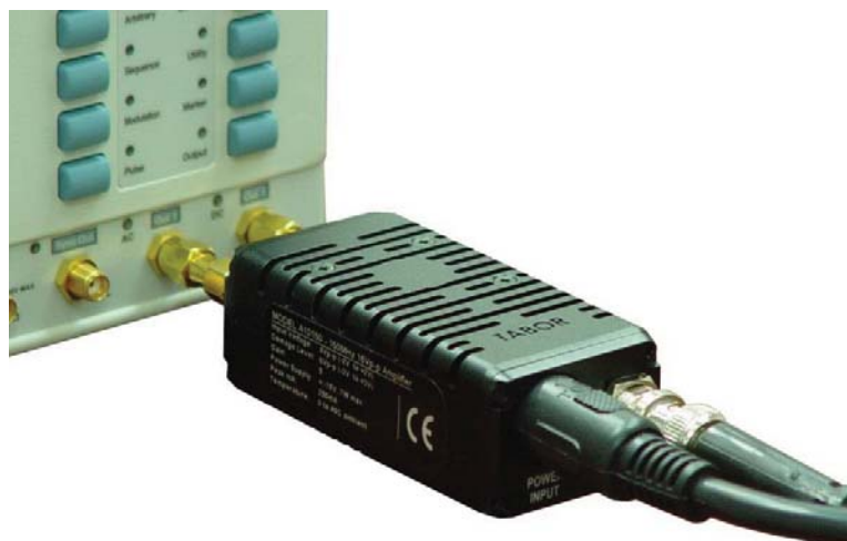
Figure 2, Connecting the A10160 to Tabor WX or WS8351/2 unit

There is no switch control to turn A10160 amplification on and off and therefore, the amplifier is active immediately after you power it up. Always make sure your load is protected from inadvertent power up conditions before you turn on your A10160.