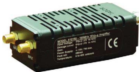
Figure 1, Model A10160